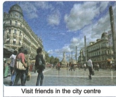
Visit friends in the city centre