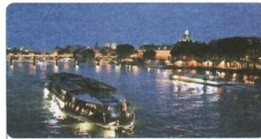
Watch the River Seine