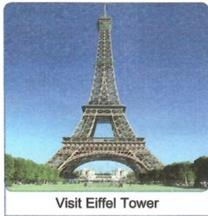
Visit Eiffel Tower