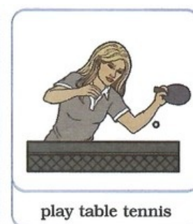
play table tennis