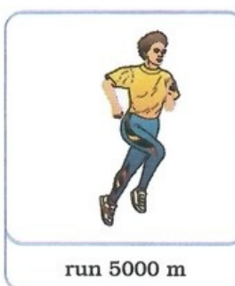
run 5000 m