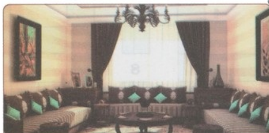
There is a nice Moroccan living-room.