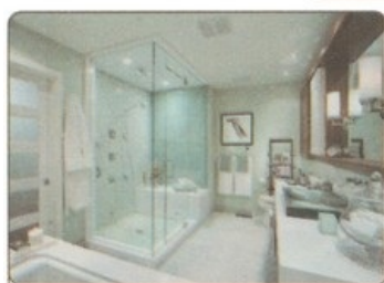
There is a lovely bathroom.