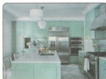
There is a modern kitchen.

2. Use a dictionary and write the names of other rooms in your notebook :