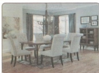
There are four chairs in the dining-room