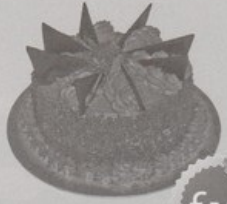
Chocolate Dream Cake